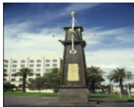
1 south african soldiers memorial alfred square st kilda front view 1996