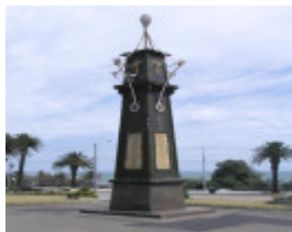
SOUTH AFRICAN WAR MEMORIAL SOHE 2008