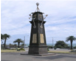
SOUTH AFRICAN WAR MEMORIAL SOHE 2008