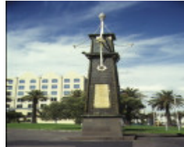
1 south african soldiers memorial alfred square st kilda front view 1996