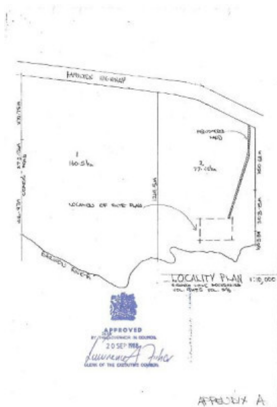
frogmore appendix a.JPG