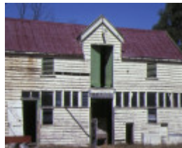
1 frogmore hamilton highway fyansford stables front view