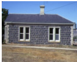
frogmore homestead hamilton highway fyansford side view