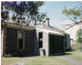
frogmore homestead hamilton highway fyansford rear elevation oct1994