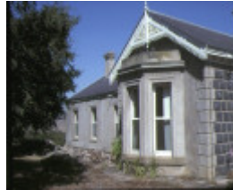
frogmore homestead hamilton highway fyansford bay window