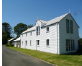
FROGMORE SOHE 2008