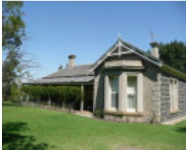
FROGMORE SOHE 2008