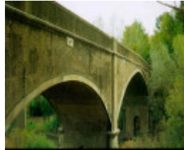
bridge over moorabool river fyansford front elevation publication