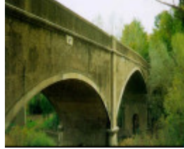
bridge over moorabool river fyansford front elevation publication