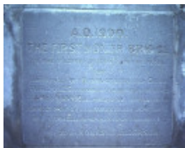
bridge over moorabool river fyansford dedication stone jul1984