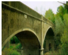
bridge over moorabool river fyansford front elevation publication