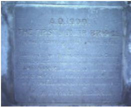
bridge over moorabool river fyansford dedication stone jul1984