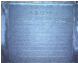
bridge over moorabool river fyansford dedication stone jul1984