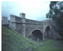
1 bridge over moorabool river fyansford side view jul1984