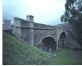
1 bridge over moorabool river fyansford side view jul1984