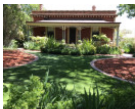
Twizel from front October 2014