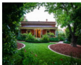
Twizel image November 2020