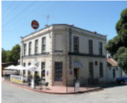
FYANSFORD HOTEL SOHE 2008