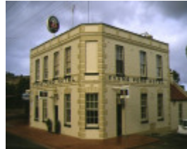
1 fyansford hotel fyansford front corner view apr1997