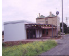
fyansford hotel fyansford rear view