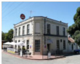
FYANSFORD HOTEL SOHE 2008