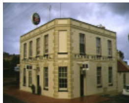
1 fyansford hotel fyansford front corner view apr1997