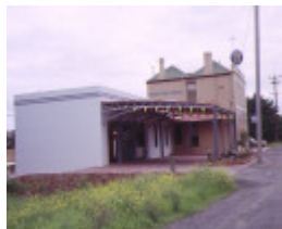
fyansford hotel fyansford rear view