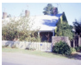
barwon paper mill complex lower paper mills road fyansford no 42 workers cottage front view she project 2003