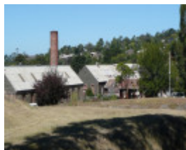
BARWON PAPER MILL COMPLEX SOHE 2008