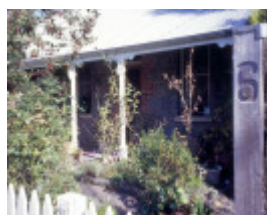
barwon paper mill complex lower paper mills road fyansford no 42 workers cottage close up she project 2003