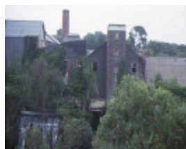
1 barwon paper mill complex fyansford view of property