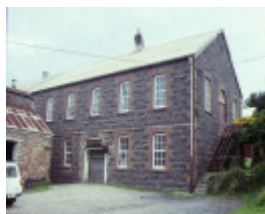
barwon paper mill complex fyansford bluestone building