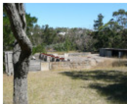
BARWON PAPER MILL COMPLEX SOHE 2008