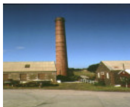
barwon paper mill complex fyansford chimney