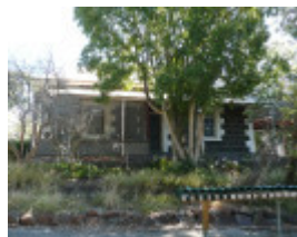
BARWON PAPER MILL COMPLEX SOHE 2008