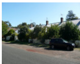
BARWON PAPER MILL COMPLEX SOHE 2008