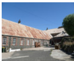
BARWON PAPER MILL COMPLEX SOHE 2008