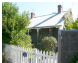
BARWON PAPER MILL COMPLEX SOHE 2008