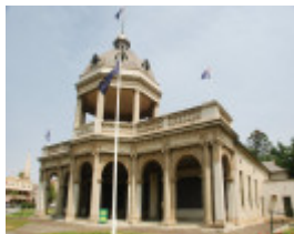
RETURNED SOLDIERS MEMORIAL HALL SOHE 2008