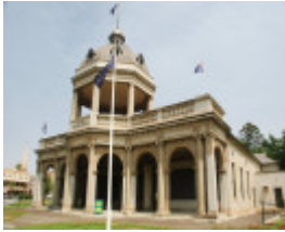
RETURNED SOLDIERS MEMORIAL HALL SOHE 2008