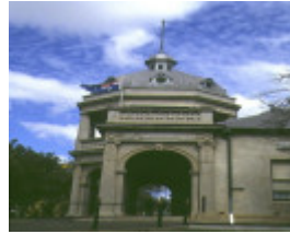
1 returned soldiers hall bendigo front dome