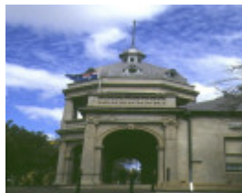
1 returned soldiers hall bendigo front dome