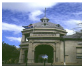
1 returned soldiers hall bendigo front dome