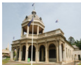
RETURNED SOLDIERS MEMORIAL HALL SOHE 2008