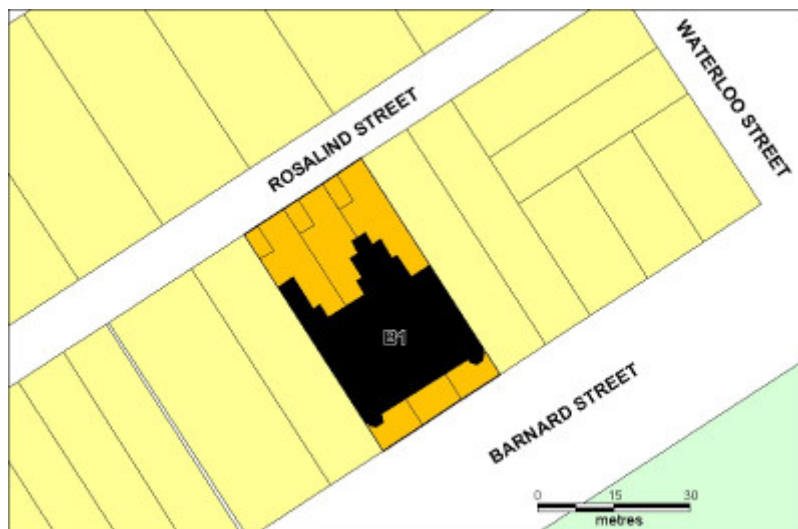
park terrace bendigo plan