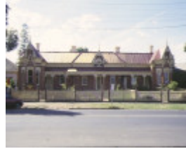
1 park terrace bernard street bendigo front elevation nov1997