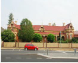
PARK TERRACE SOHE 2008