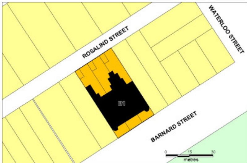
park terrace bendigo plan