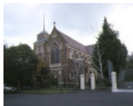
1 st james church gardenvale front view jul1992