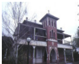
st james church gardenvale front view of rectory jul78