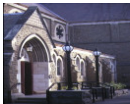
st james church gardenvale north entrance jul1978