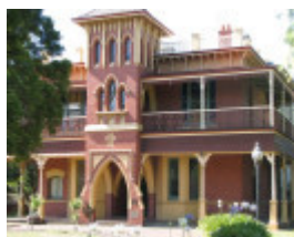
ST. JAMES CHURCH AND PRESBYTERY SOHE 2008