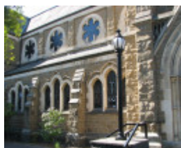
ST. JAMES CHURCH AND PRESBYTERY SOHE 2008