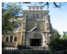
ST. JAMES CHURCH AND PRESBYTERY SOHE 2008