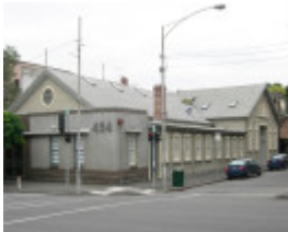
EAST COLLINGWOOD RIFLES VOLUNTEER ORDERLY ROOM SOHE 2008