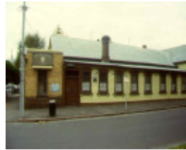
1 east collingwood rifles volunteer ordely room east melbourne