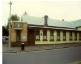
1 east collingwood rifles volunteer ordely room east melbourne