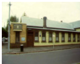
1 east collingwood rifles volunteer ordely room east melbourne