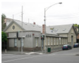
EAST COLLINGWOOD RIFLES VOLUNTEER ORDERLY ROOM SOHE 2008