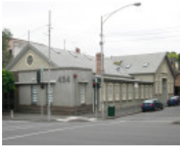
EAST COLLINGWOOD RIFLES VOLUNTEER ORDERLY ROOM SOHE 2008