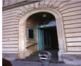
former geelong wool exchange corio street geelong detail of front entrance