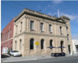
FORMER GEELONG WOOL EXCHANGE SOHE 2008