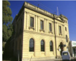
1 former geelong wool exchange corio street geelong front view