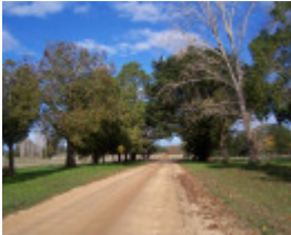
Hotspur Avenue of Honour