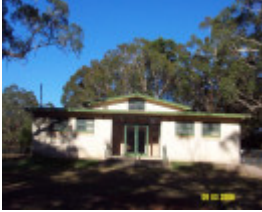
52353 Memorial Hall HOtspur 061