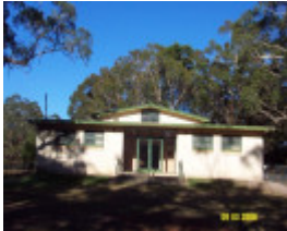
52353 Memorial Hall HOtspur 061