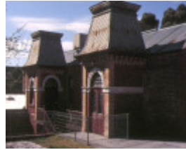
1 fuse factory bendigo side view