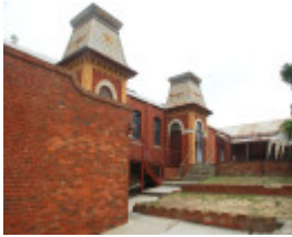
ASCENSION BOOKSHOP SOHE 2008