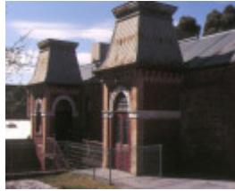
1 fuse factory bendigo side view