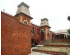
ASCENSION BOOKSHOP SOHE 2008