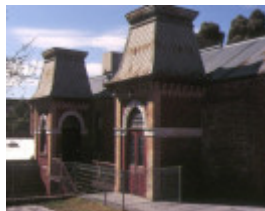
1 fuse factory bendigo side view