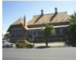
1 infant building moonee ponds west primary school eglington street moonee ponds street view oct1996