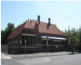
INFANT BUILDING, MOONEE PONDS WEST PRIMARY SCHOOL SOHE 2008