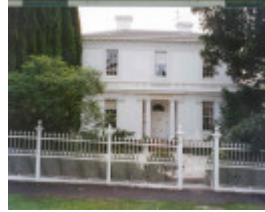
h00192 1 merchiston hall garden street geelong street view