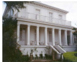
h00192 merchiston hall garden street geelong rear