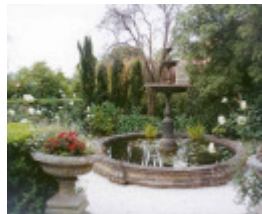
h00192 merchiston hall garden street geelong fountain