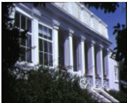
merchiston hall garden street geelong front entrance