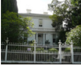
MERCHISTON HALL SOHE 2008