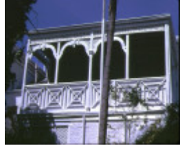
merchiston hall garden street geelong balcony detail view