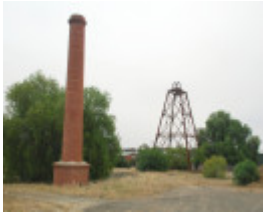
NORTH DEBORAH QUARTZ GOLD MINE SOHE 2008