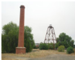
NORTH DEBORAH QUARTZ GOLD MINE SOHE 2008