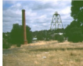
1 north deborah mine bendigo site view feb1990