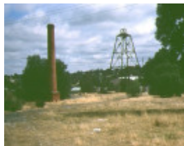
1 north deborah mine bendigo site view feb1990