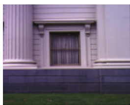
geelong town hall gheringhap street geelong window detail