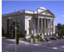
geelong town hall gheringhap street geelong front corner view