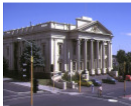
geelong town hall gheringhap street geelong front corner view