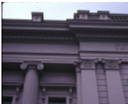
geelong town hall gheringhap street geelong column detail