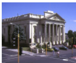
geelong town hall gheringhap street geelong front corner view