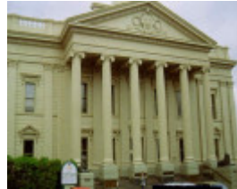
geelong town hall gheringhap street geelong front elevation publication