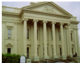
geelong town hall gheringhap street geelong front elevation publication