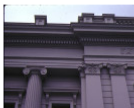
geelong town hall gheringhap street geelong column detail