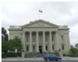
GEELONG TOWN HALL SOHE 2008