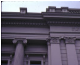
geelong town hall gheringhap street geelong column detail