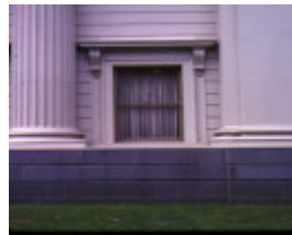
geelong town hall gheringhap street geelong window detail