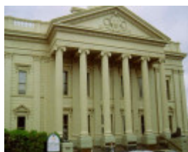
geelong town hall gheringhap street geelong front elevation publication