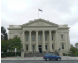
GEELONG TOWN HALL SOHE 2008