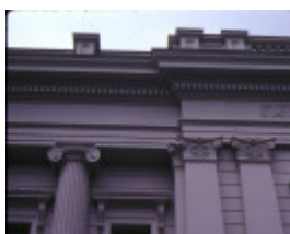
geelong town hall gheringhap street geelong column detail