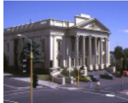
geelong town hall gheringhap street geelong front corner view