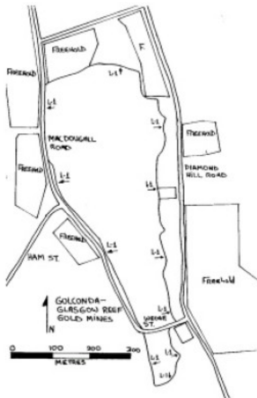
golconda glasgow reef golden gully battery plan