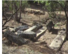
1 golconda glasgow reef golden gully boiler footings may1993