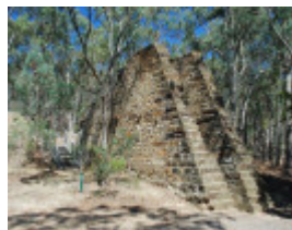
GARFIELD WATERWHEEL QUARTZ GOLD MINING SITE SOHE 2008