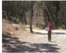
1 garfield waterwheel quartz gold mining site quartz hill track chewton front view jan1990