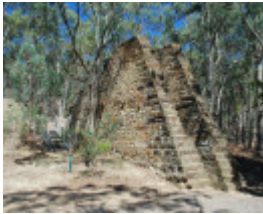
GARFIELD WATERWHEEL QUARTZ GOLD MINING SITE SOHE 2008