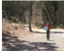
1 garfield waterwheel quartz gold mining site quartz hill track chewton front view jan1990