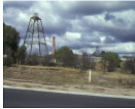
1 deborah co quartz gold mine site view may 1993