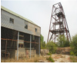
DEBORAH COMPANY QUARTZ GOLD MINE SOHE 2008