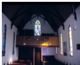
h01350 holy trinity anglican church and sunday school davy street taradale inside church she project 2003