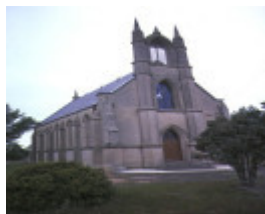
1 holy trinity anglican chruch davy street taradale front view