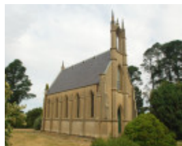
HOLY TRINITY ANGLICAN CHURCH AND SUNDAY SCHOOL HALL SOHE 2008