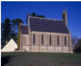
h01350 holy trinity anglican church and sunday school davy street taradale north face she project 2003