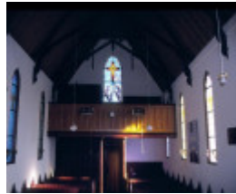
h01350 holy trinity anglican church and sunday school davy street taradale inside church she project 2003