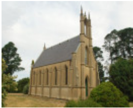
HOLY TRINITY ANGLICAN CHURCH AND SUNDAY SCHOOL HALL SOHE 2008