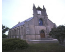
1 holy trinity anglican church and sunday school davy street taradale front view