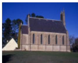
h01350 holy trinity anglican church and sunday school davy street taradale north face she project 2003