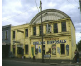
1 former brown bros iron store mercer street geelong front view