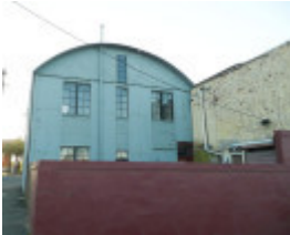
IRON STORE SOHE 2008