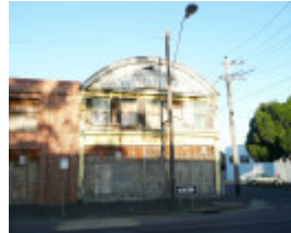
IRON STORE SOHE 2008