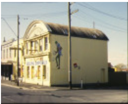
former brown bros iron store mercer street geelong side view