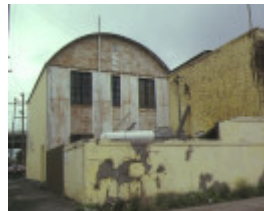
former brown bros iron store mercer street geelong rear view