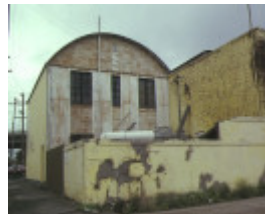
former brown bros iron store mercer street geelong rear view