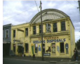
1 former brown bros iron store mercer street geelong front view