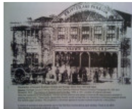
Old front shop-Iron Store.JPG