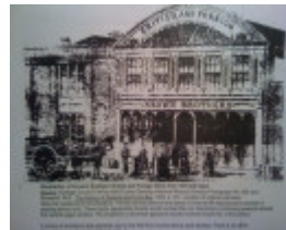
Old front shop-Iron Store.JPG