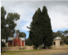
maldon Cemetery Oct 2010