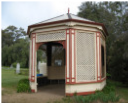
maldon Cemetery Oct 2010