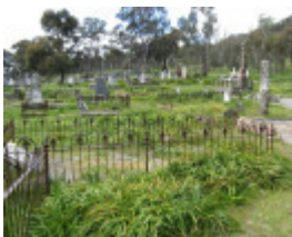
maldon Cemetery Oct 2010