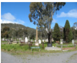
maldon Cemetery Oct 2010