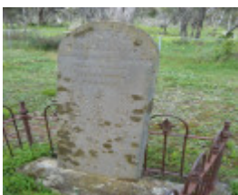
maldon Cemetery Oct 2010