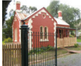
maldon Cemetery Oct 2010