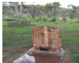
maldon Cemetery Oct 2010