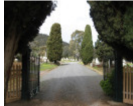
maldon Cemetery Oct 2010