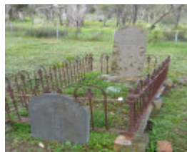
maldon Cemetery Oct 2010