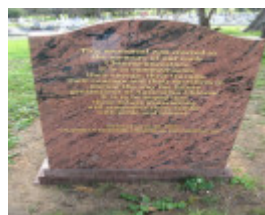
maldon Cemetery Oct 2010