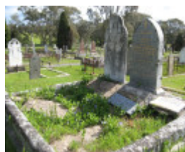
maldon Cemetery Oct 2010