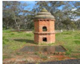
maldon Cemetery Oct 2010