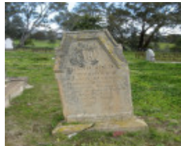
maldon Cemetery Oct 2010