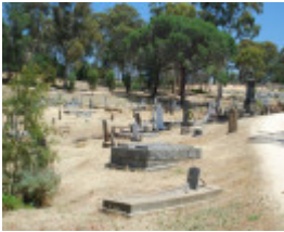
CASTLEMAINE PUBLIC CEMETERY (CAMPBELL'S CREEK) SOHE 2008