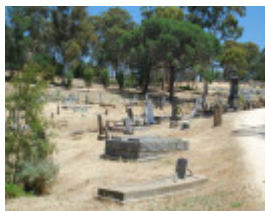
CASTLEMAINE PUBLIC CEMETERY (CAMPBELL'S CREEK) SOHE 2008