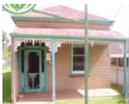
52841 CWA ROOMS