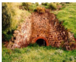
lime kiln complex limeburners point geelong front view