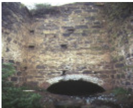
lime4 kiln complex limeburners point geelong kiln detail