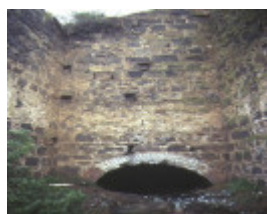
lime4 kiln complex limeburners point geelong kiln detail