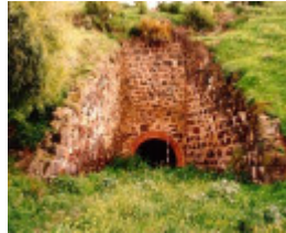
lime kiln complex limeburners point geelong front view