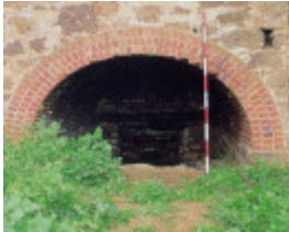
lime kiln complex limeburners point geelong arched entrance publication