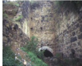
lime kiln complex limeburners point geelong east brickwork detail july 1984