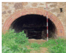
lime kiln complex limeburners point geelong arched entrance publication