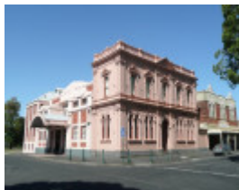
THEATRE ROYAL AND MECHANICS INSTITUTE SOHE 2008