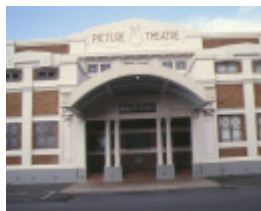
1 theatre royal & mechanics institute camperdown front view of theatre