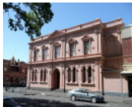
THEATRE ROYAL AND MECHANICS INSTITUTE SOHE 2008