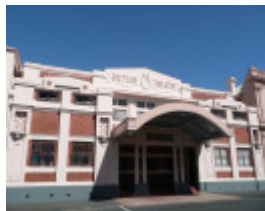
THEATRE ROYAL AND MECHANICS INSTITUTE SOHE 2008