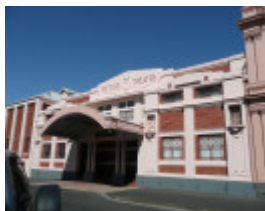
THEATRE ROYAL AND MECHANICS INSTITUTE SOHE 2008