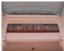
THEATRE ROYAL AND MECHANICS INSTITUTE SOHE 2008