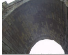
bridge over djerriwarrh creek bacchus marsh arch detail sep1984