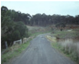
bridge over djerriwarrh creek bacchus marsh view of road sep1984