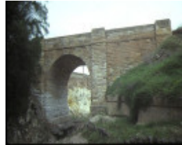
1 bridge over djerriwarrh creek bacchus marsh front elevation sep1984