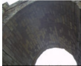
bridge over djerriwarrh creek bacchus marsh arch detail sep1984