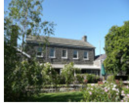
TIMBOON HOUSE SOHE 2008