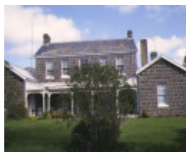
h01387 timboon house camperdown front view sep1997