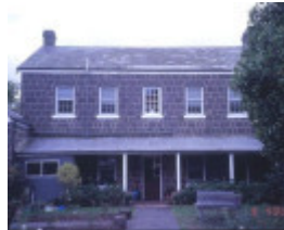
h01387 timboon house old geelong road camperdown back of house she project 2003