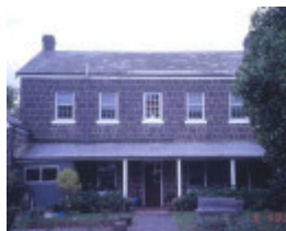
h01387 timboon house old geelong road camperdown back of house she project 2003