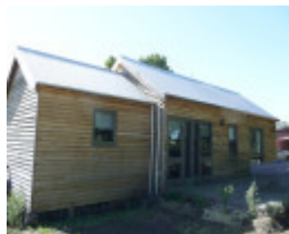
TIMBOON HOUSE SOHE 2008