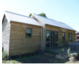
TIMBOON HOUSE SOHE 2008