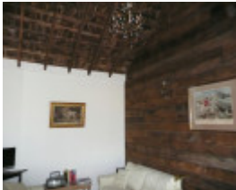
TIMBOON HOUSE SOHE 2008