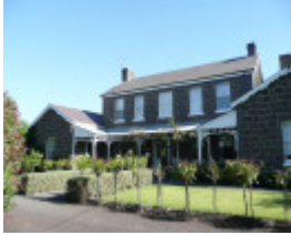
TIMBOON HOUSE SOHE 2008