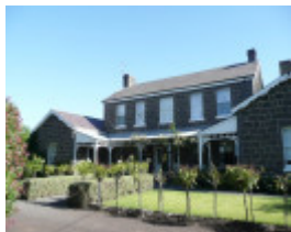
TIMBOON HOUSE SOHE 2008