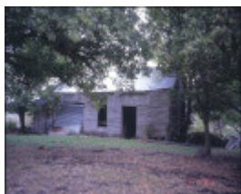
h01387 timboon house old geelong road camperdown original stables she project 2003