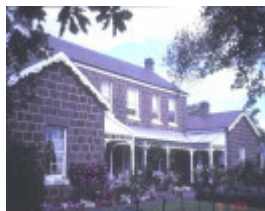
h01387 1 timboon house old geelong road camperdown front drive she project 2003