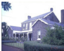
h01387 timboon house old geelong road camperdown west side she project 2003