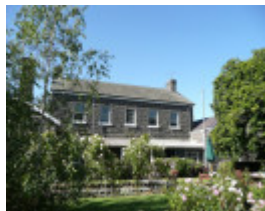
TIMBOON HOUSE SOHE 2008