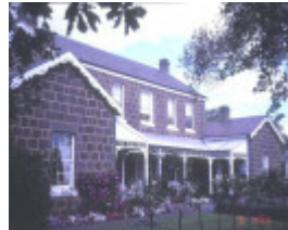
h01387 1 timboon house old geelong road camperdown front drive she project 2003