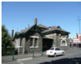
CAMPERDOWN POST OFFICE SOHE 2008