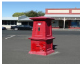
CAMPERDOWN POST OFFICE SOHE 2008