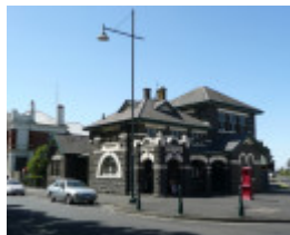
CAMPERDOWN POST OFFICE SOHE 2008