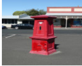
CAMPERDOWN POST OFFICE SOHE 2008