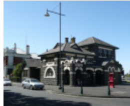
CAMPERDOWN POST OFFICE SOHE 2008