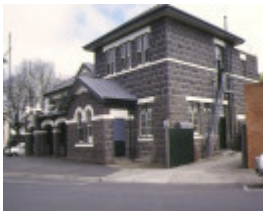
1 camperdown post office front view sep1997