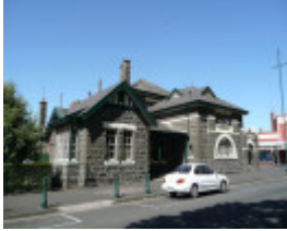
CAMPERDOWN POST OFFICE SOHE 2008