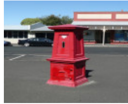
CAMPERDOWN POST OFFICE SOHE 2008