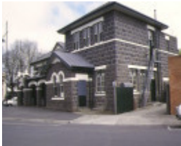
1 camperdown post office front view sep1997