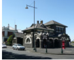
CAMPERDOWN POST OFFICE SOHE 2008