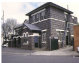
1 camperdown post office front view sep1997