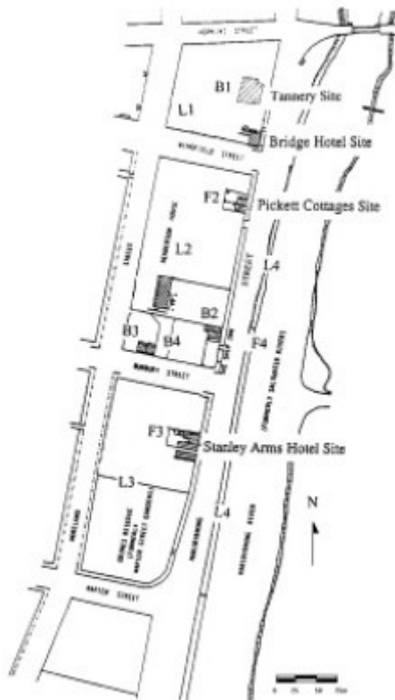
Saltwater River Crossing Site & Footscray Wharves Precinct Plan