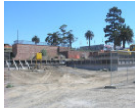
SALTWATER RIVER CROSSING SITE AND FOOTSCRAY WHARVES PRECINCT SOHE 2008