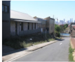
SALTWATER RIVER CROSSING SITE AND FOOTSCRAY WHARVES PRECINCT SOHE 2008