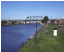
1 saltwater river crossing site & footscray wharves precinct maribyrnong river foreshore aug1988