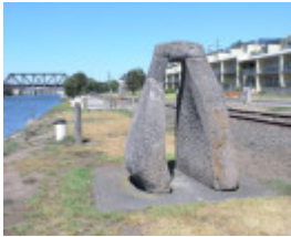
SALTWATER RIVER CROSSING SITE AND FOOTSCRAY WHARVES PRECINCT SOHE 2008