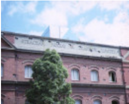
former strachan murray & shannon wool warehouse geelong view of top floor oct1987