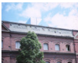
former strachan murray & shannon wool warehouse geelong view of top floor oct1987