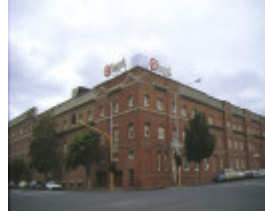
1 former strachan murray & shannon wool warehouse geelong corner view apr1997