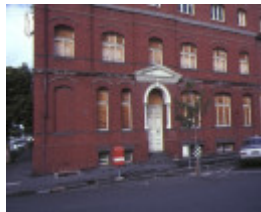
former strachan murray & shannon wool warehouse geelong view of entrance jul1985