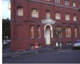
former strachan murray & shannon wool warehouse geelong view of entrance jul1985