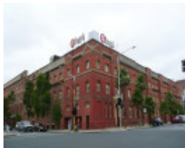
FORMER STRACHAN MURRAY AND SHANNON WOOL WAREHOUSES SOHE 2008