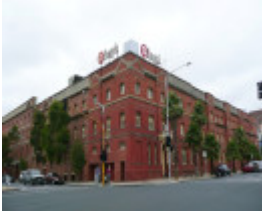
FORMER STRACHAN MURRAY AND SHANNON WOOL WAREHOUSES SOHE 2008