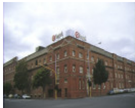
1 former strachan murray & shannon wool warehouse geelong corner view apr1997