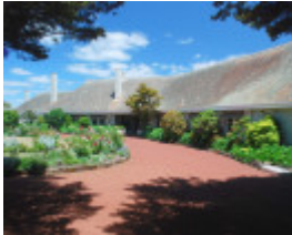
HENDRA SOHE 2008