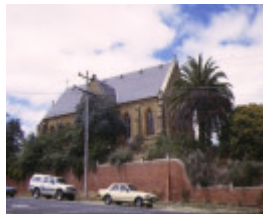
h01392 christ church mostyn street castlemaine side view nov1997