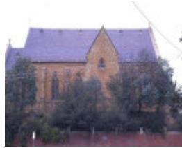
christ church mostyn st castlemaine iconic image she project 2003