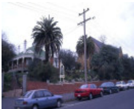
christ church mostyn st castlemaine rectory and church aspect she project 2003