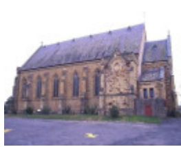
h01392 1 christ church mostyn st castlemaine south east aspect she project 2003