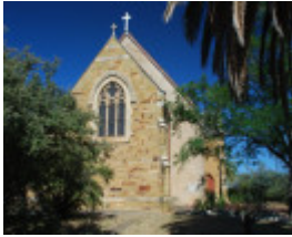
CHRIST CHURCH SOHE 2008