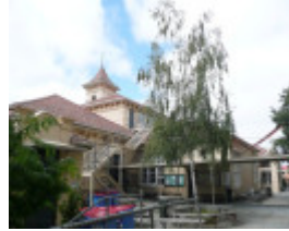
MATTHEW FLINDERS SCHOOL NO.8022 SOHE 2008