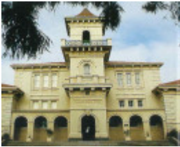
matthew flinders school number 8022 myers street geelong entrance publication