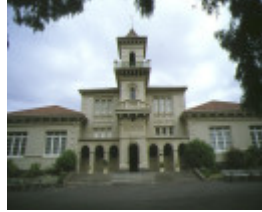
1 matthew flinders school number 8022 geelong front elevation