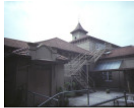
matthew flinders school number 8022 myers street geelong rear view