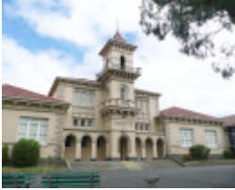
MATTHEW FLINDERS SCHOOL NO.8022 SOHE 2008