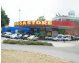
BEAUREPAIRE MOTOR GARAGE SOHE 2008