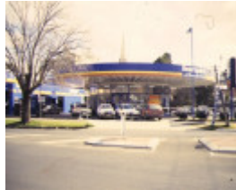
1 beaurepaire motor garage hargraves street bendigo front view