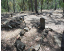
VAUGHAN CHINESE CEMETERY SOHE 2008