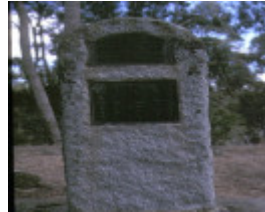
1 vaghan chinese cemetery castlemaine road vaghan detail