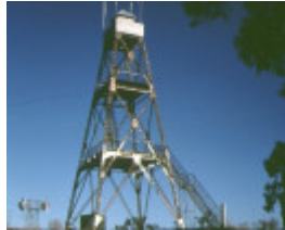
1 mount tarrengower lookout tower mount tarrengower maldon front view feb1997