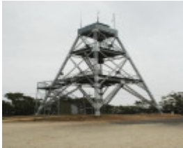
MOUNT TARRENGOWER LOOK-OUT TOWER SOHE 2008