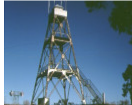
1 mount tarrengower lookout tower mount tarrengower maldon front view feb1997