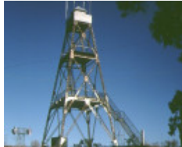
1 mount tarrengower lookout tower mount tarrengower maldon front view feb1997