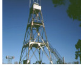
1 mount tarrengower lookout tower mount tarrengower maldon front view feb1997