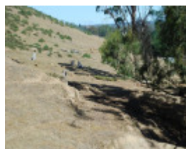
CEMETERY REEF GULLY CEMETERY SOHE 2008