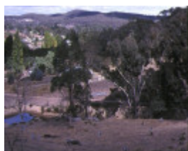
1 cemetery reef gully cemetery mount street chewton site view feb1997