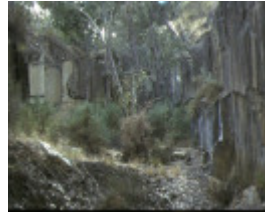
1 specimen gully flagstone quarry barkers creek castlemaine side view