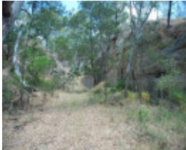
SPECIMEN GULLY FLAGSTONE QUARRY SOHE 2008