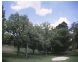
1 connacks valonia oak plantation elliot street castlemaine oak detail nov1997