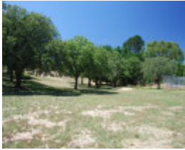
CUNNACKS VALONIA OAK PLANTATION SOHE 2008