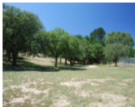
CUNNACKS VALONIA OAK PLANTATION SOHE 2008