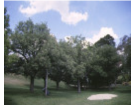
1 cunnacks valonia oak plantation elliot street castlemaine oak detail nov1997