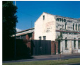
h01810 4 melbourne omnibus building 1997