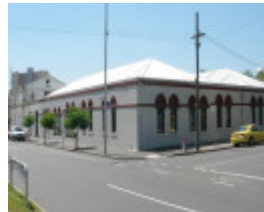
FORMER MELBOURNE OMNIBUS COMPANYS STABLES SOHE 2008