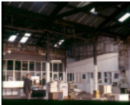
h01810 3 melbourne omnibus building 1997