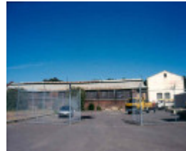
h01810 2 melbourne omnibus building 1997