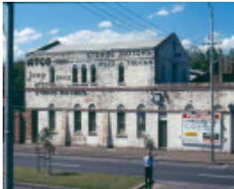
h01810 1 melbourne omnibus building 1997