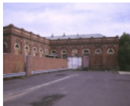
1 gas regulating house macaulay road north melbourne rear view apr1998