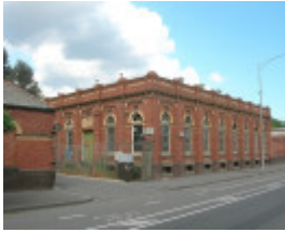
GAS REGULATING HOUSE SOHO 2008