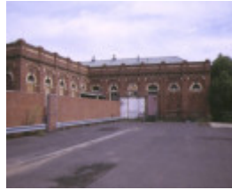
1 gas regulating house macaulay road north melbourne rear view apr1998