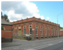
GAS REGULATING HOUSE SOHE 2008