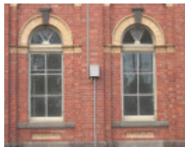
GAS REGULATING HOUSE SOHE 2008