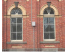
GAS REGULATING HOUSE SOHO 2008