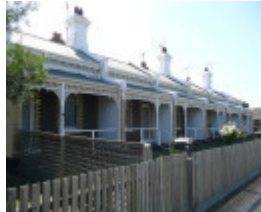
AUSTIN HALL AND TERRACE COMPLEX SOHE 2008