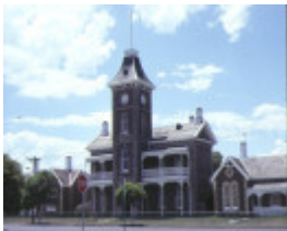
austin hall & terrace complex yarra & mundy streets south geelong front view of austin hall jan1997