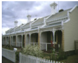
austin hall & terrace complex yarra & mundy streets south geelong row of terrace houses yarra street apr1997