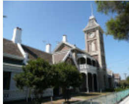
AUSTIN HALL AND TERRACE COMPLEX SOHE 2008