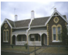
austin hall & terrace complex yarra & mundy streets south geelong terrace complex apr1997