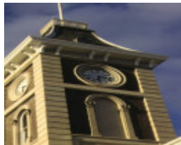
austin hall & terrace complex yarra & mundy streets south geelong detail of clock tower mar1995