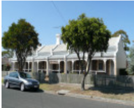
AUSTIN HALL AND TERRACE COMPLEX SOHE 2008