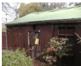
h01946 walmsley house cnr royal parade and gatehouse st parkville side she project 2004