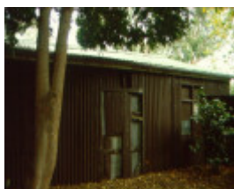
h01946 walmsley house royal park march 2001