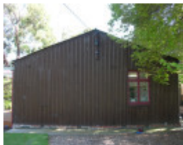
THE WALMSLEY HOUSE SOHE 2008