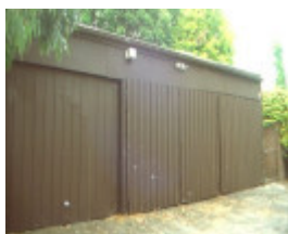
10 walmsley house royal park march 2001