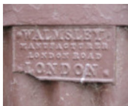
h01946 walmsley house cnr royal parade and gatehouse st parkville sign she project 2004