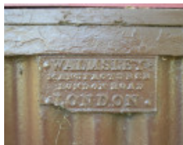
THE WALMSLEY HOUSE SOHE 2008