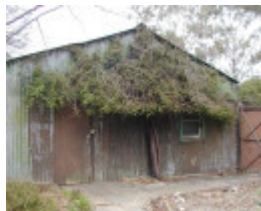
h01946 1 walmsley house cnr royal parade and gatehouse st parkville door she project 2004