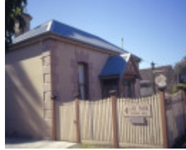
h00661 former shearers arms hotel aberdeen street geelong side view she project 2003