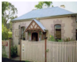
former shearers arms hotel aberdeen street geelong front elevation publication