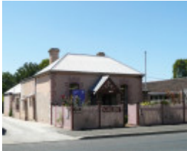
FORMER SHEARERS ARMS HOTEL SOHE 2008