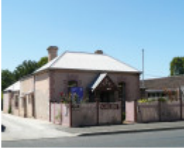
FORMER SHEARERS ARMS HOTEL SOHE 2008