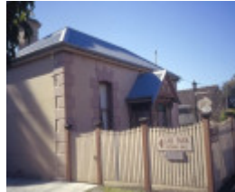
h00661 former shearers arms hotel aberdeen street geelong side view she project 2003