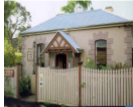
former shearers arms hotel aberdeen street geelong front elevation publication