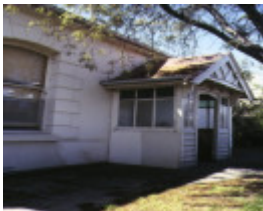
former shearers arms hotel aberdeen street geelong street front entrance