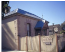
h00661 former shearers arms hotel aberdeen street geelong side view she project 2003