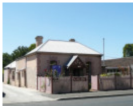
FORMER SHEARERS ARMS HOTEL SOHE 2008