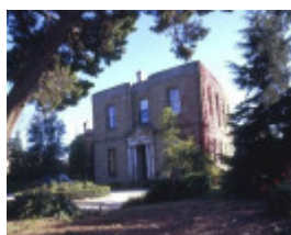
lunan house lunan avenue drumcondra front view