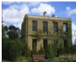
lunan house geelong west rear elevation lunan house apr1997