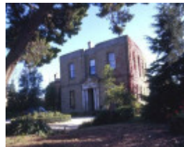
lunan house lunan avenue drumcondra front view