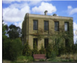
lunan house geelong west rear elevation lunan house apr1997