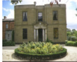
1 lunan house geelong west front elevation lunan house apr1997