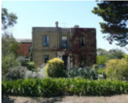
LUNAN HOUSE SOHE 2008