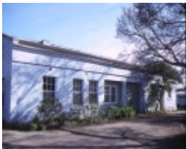
lunan house geelong west side view of wing jul1984