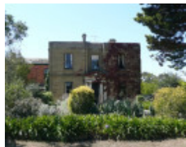
LUNAN HOUSE SOHE 2008