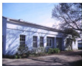
lunan house geelong west side view of wing jul1984