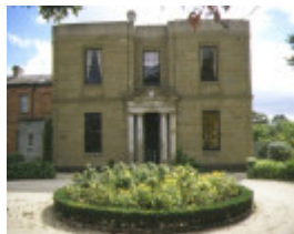
1 lunan house geelong west front elevation lunan house apr1997