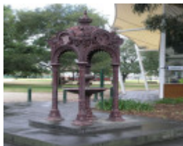
WILKINSON MEMORIAL DRINKING FOUNTAIN SOHE 2008