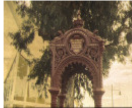
1 wilkinson memorial drinking fountain nelson place inscription apr1998