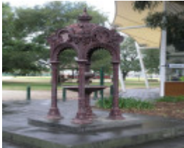
WILKINSON MEMORIAL DRINKING FOUNTAIN SOHE 2008