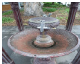
WILKINSON MEMORIAL DRINKING FOUNTAIN SOHE 2008