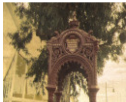
1 wilkinson memorial drinking fountain nelson place inscription apr1998