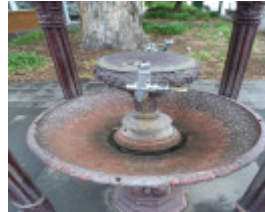
WILKINSON MEMORIAL DRINKING FOUNTAIN SOHE 2008