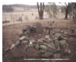
1 pennyweight flat cemetery colles road castlemaine top view may1997