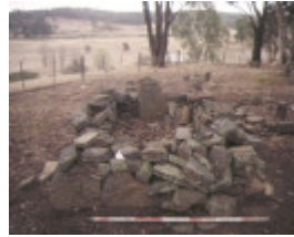
1 pennyweight flat cemetery colles road castlemaine top view may1997