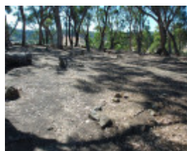
PENNYWEIGHT FLAT CEMETERY SOHE 2008