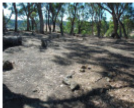
PENNYWEIGHT FLAT CEMETERY SOHE 2008