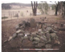
1 pennyweight flat cemetery colles road castlemaine top view may1997