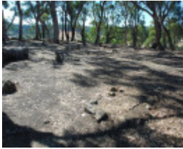
PENNYWEIGHT FLAT CEMETERY SOHE 2008